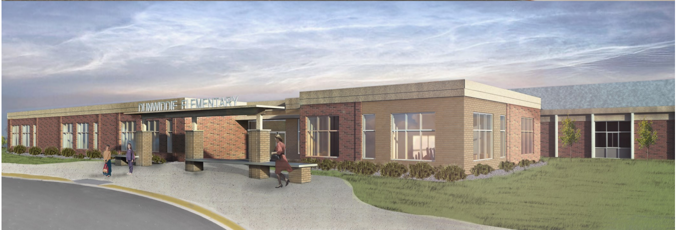
Top: Port Washington High School